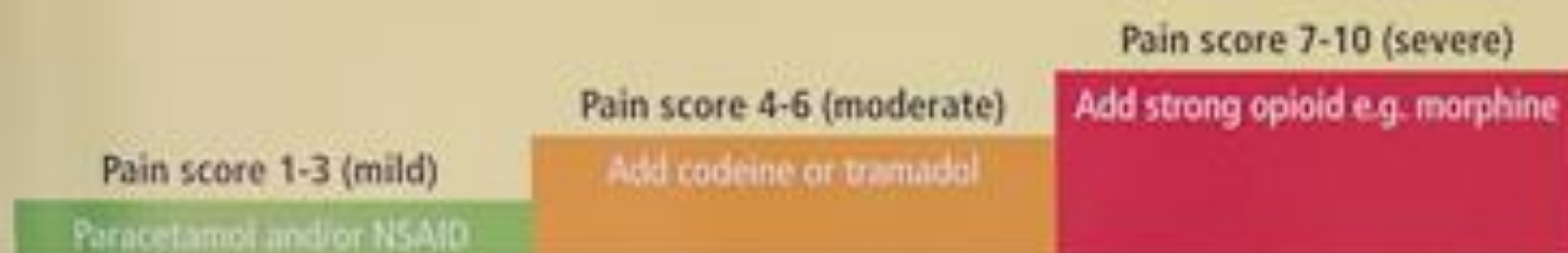
Example of pain ladder based on WHO Analgesic Ladder